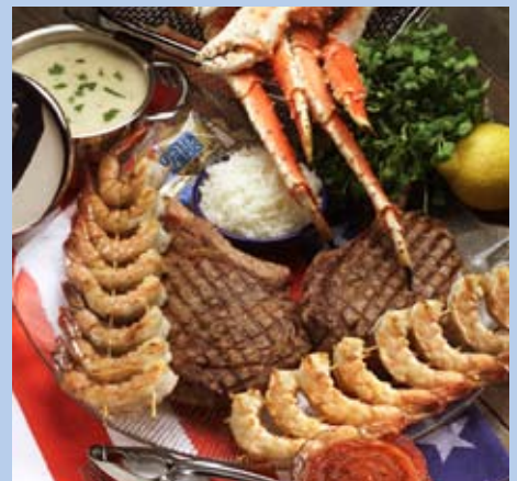
Signature offerings from Bubba Gump Shrimp Co.